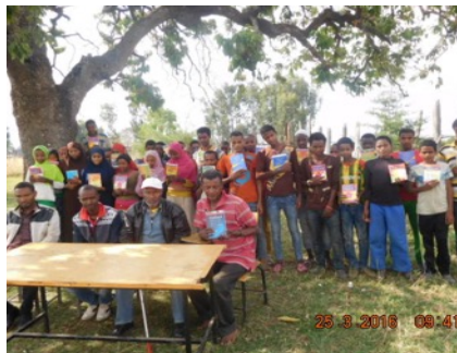
Students at Borana Tuba with their new books

Dir Biyabir has been funding the purchase of school books in the Gurage Zone since 2014. Based on a written proposal from schools specifically listing the books they need, Dir Biyabir has been working with our implementation partner Journey to Light (JTL) to fund the purchase of books for 6 schools in this area. In 2014 - 2015 we funded books for Yedege, Anano, Bojebbar, and Negoder Elementary schools, all in the Wereda (district) of Edja. In 2015 the Dir Biyabir Chairperson visited these schools as well as additional schools in the area while on a self-funded trip to Ethiopia. Based on her visit and discussions with teachers and students she was convinced of the effectiveness of this initiative (which according to teachers has resulted in a 90% improvement in the number of students passing the 8th grade National exam). In 2016 Dir Biyabir funded the purchase of school books for two additional schools in Cheha Wereda per the list of books they submitted to Dir Biyabir. In April 2016, Borana Tuba Primary School received 188 books and Bakanwote Elementary School received 358 books. We are confident these students will make good use of these books and wish them much success in their studies.