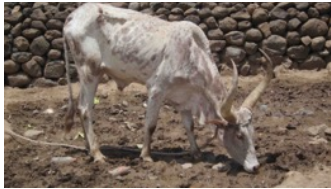
Ox at Kure Beret

In 2015 to 2016 the worst drought in 50 years impacted various areas of Ethiopia including the Northern Shewa region. The specific area where Dir Biyabir and ADHENO have been implementing Integrated Environmental Rehabilitation and Economic Empowerment projects in the Bassona