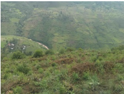
Trees planted in "Debir Gott" - Weyniye

As we launch into the new year we reflect back into 2016 and find that in many ways it was both a challenging and fruitful year for Dir Biyabir. The worst drought in Ethiopia in 50 years led us to do a special online fundraiser effort in January -February. Thanks to the generous support of a small group of members and other donors, the funds raised far exceeded our goals. Though Dir Biyabir normally does not participate in emergency relief, the extent of the problem required our action. We note with gratitude that our direct project area in Northern Shewa i.e the wereda (district) of Bassona Worana was minimally impacted by the drought and we believe this is a sign of the effectiveness of the Environmental Rehabilitation and Economic Empowerment projects that we have been funding in this area via our partner ADHENO. 100% of funds