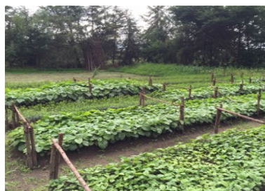
Debre Birhan Seedling Station

In June of 2015, Dir Biyabir and our implementation partner ADHENO launched phase 4 of our largest project, "Integrated Environmental Rehabilitation and Economic Empowerment". This 2 year project in the kebele (sub-district) of Weyniye (pop. 2,528) in Northern Shewa, was funded with an $80,000 grant from TCF. As in prior phases, the goal of phase 4 of this project is economic empowerment and