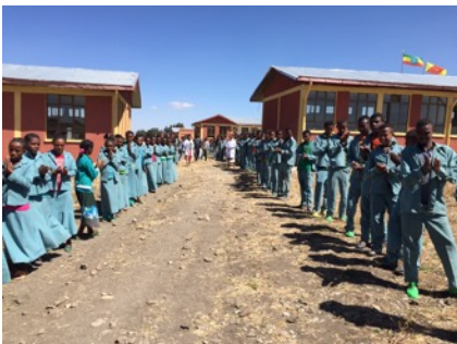
Goshebado Students Welcome Dir Biyabir

Most of Dir Biyabir’s projects are funded by the membership fees and donations of our members, so as always a very special Thank You goes to our new members as well as our renewing members. By renewing their membership year after year, our long-time members has been especially critical in giving us a continued stream of revenue to fund our projects, so we are always gratified and encouraged by their support. If you like what we do, the best way to support us is by continuing to renew your membership and by encouraging friends and family to join Dir Biyabir. For our part, we will continue to commit that 100% of your membership fees and donations will be allocated to projects in Ethiopia.