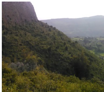
"Gedenbo Gott" in Weyniye

2) Via Pay Pal on our website: http://dirbiyabir.org/page/become-a-member