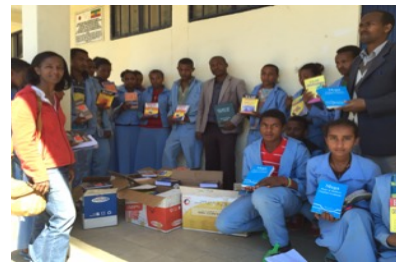
Books Delivered to Debre Eba High